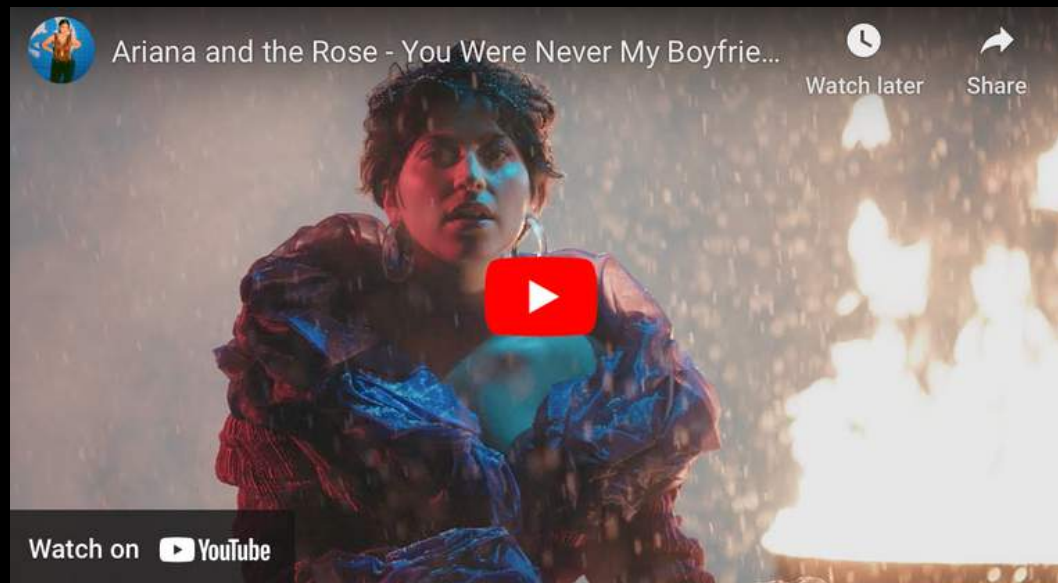
You Were Never My Boyfriend