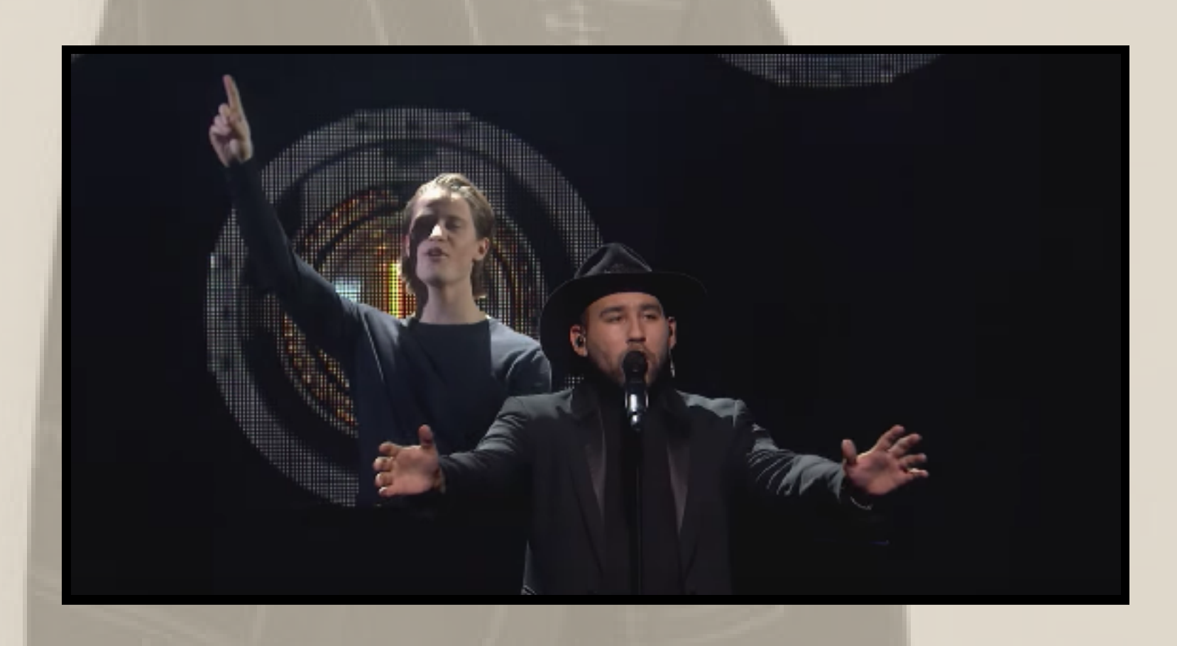
STOLE THE SHOW 2015 NOBEL PEACE PRIZE CONCERT