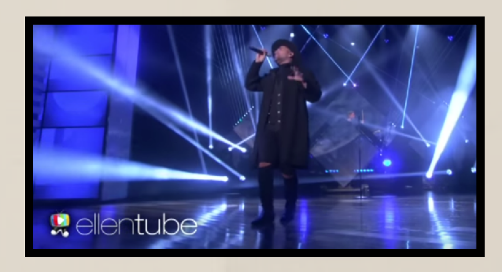
STOLE THE SHOW THE ELLEN SHOW