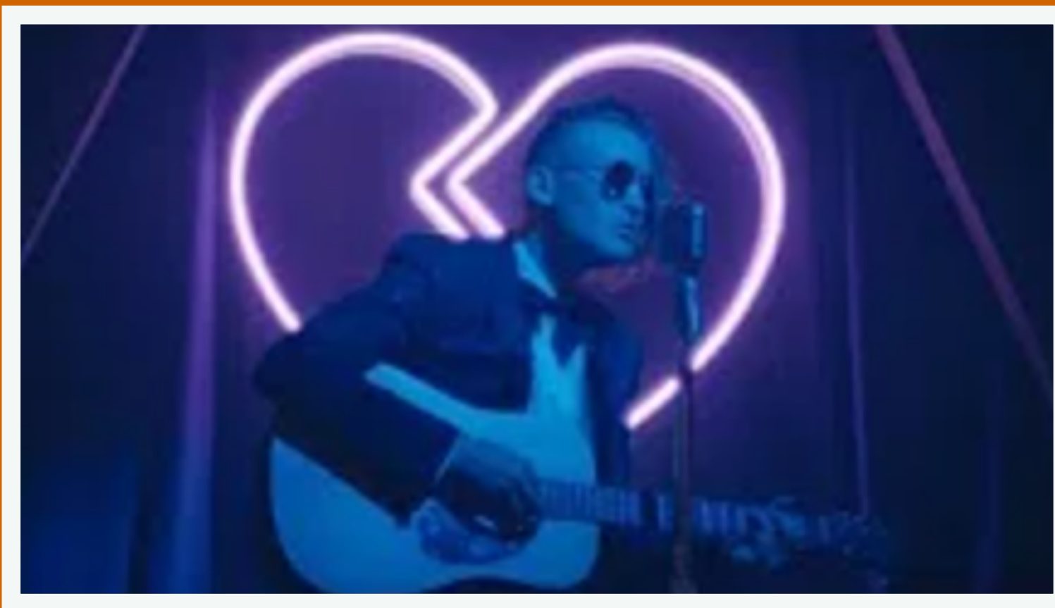
the broken hearts club [mv]