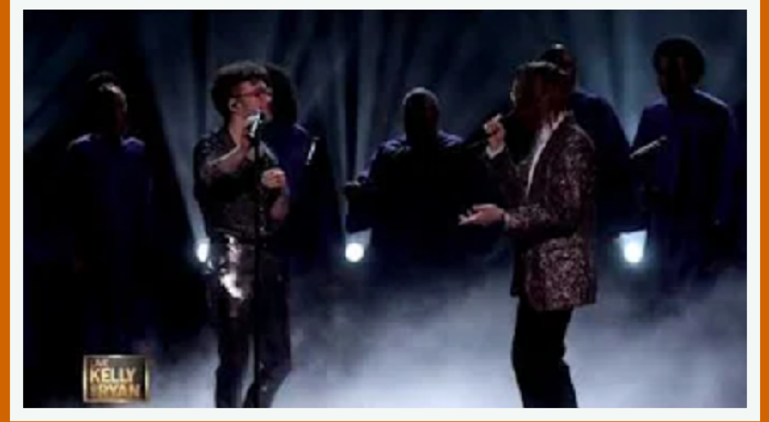
MAX & gnash "Live With Kelly And Ryan" Oscar Special - Lights Down Low